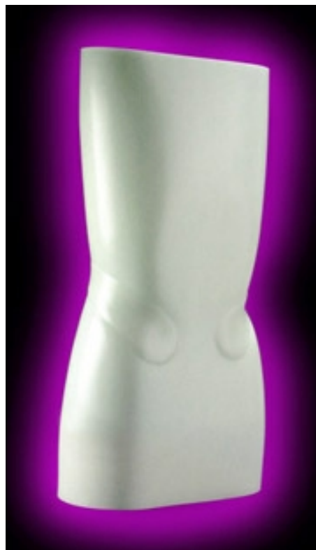
NEW ENGLAND SCOLIOSIS BRACE

ATLANTIC RIM BRACE MANUFACTURING CORP. 29 Front Street Suite 5A Nashua, NH 03060